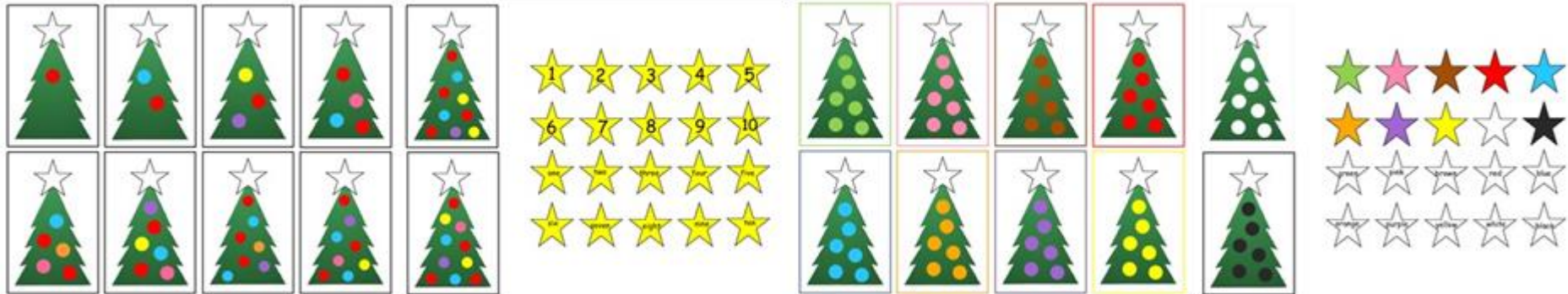
Christmas Tree Colors and Counting Folder Game Set - 4 Games in 2 Folders